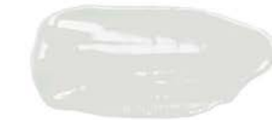
Light French Grey